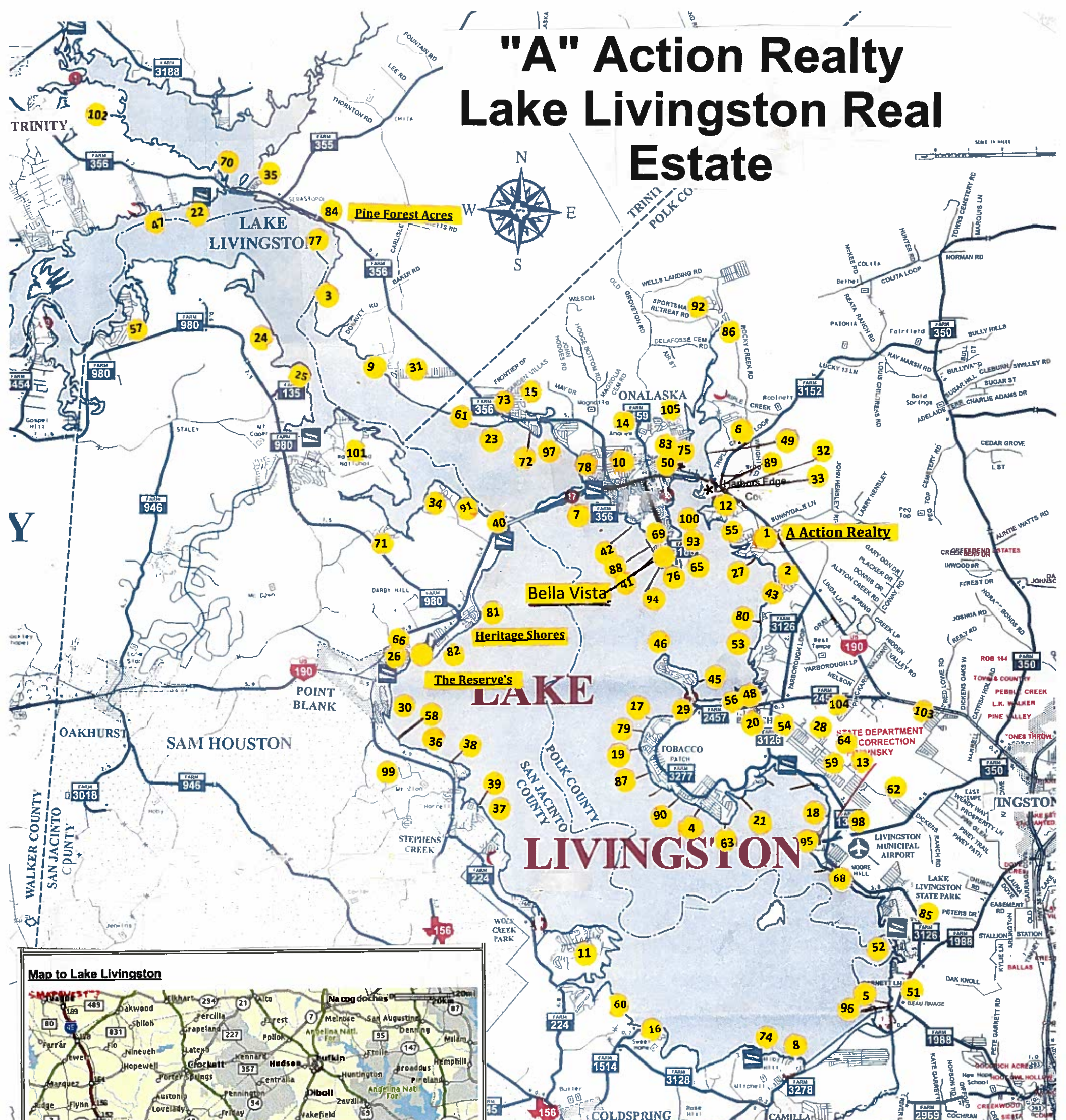
Map to Lake Livingston